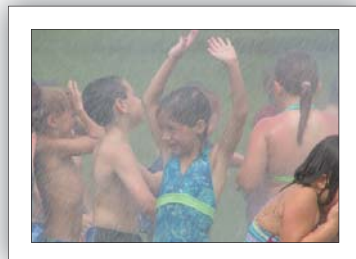
Summer fun in Aiken

If you would like to send your child to some type of summer camp, there are many options. Before making a decision, consider whether the camp is day or residential. Day camps include activities such as music, swimming and