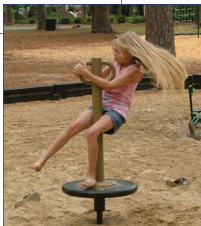
Children enjoyed games, food and a full playground at last year's asthma event.

Project Breathe Easy is free and confidential .