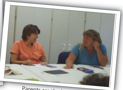
Parents are the best source of information and support.