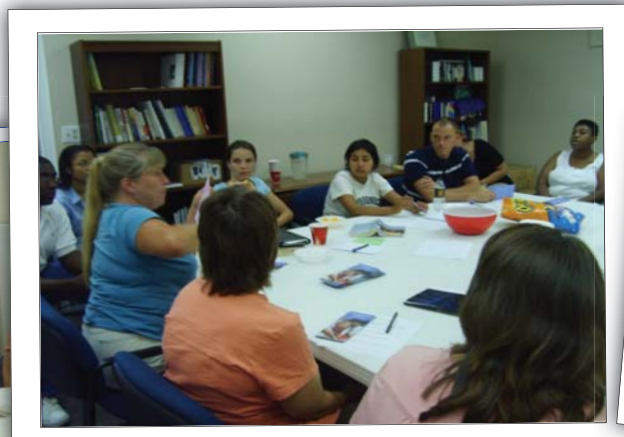
Parents are able to receive valuable advice from other parents and share concerns and issues.