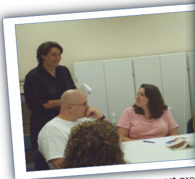
Parents met at an autism support group and heard from a parent who updated the group on Ryan's Law.

Many parents who have a child with special needs sometimes experience an overwhelming sense of confusion - a sense that they have fallen into this world of disabilities that they know little about. While this feeling may continue for some time, parent-to-parent connections are an outlet for parents to gain emotional support and answers to their questions from parents who know it best. Support groups are a way for parents to truly connect, sharing stories, concerns, resources and information. Family Connection calls these groups “Parent Connections”.